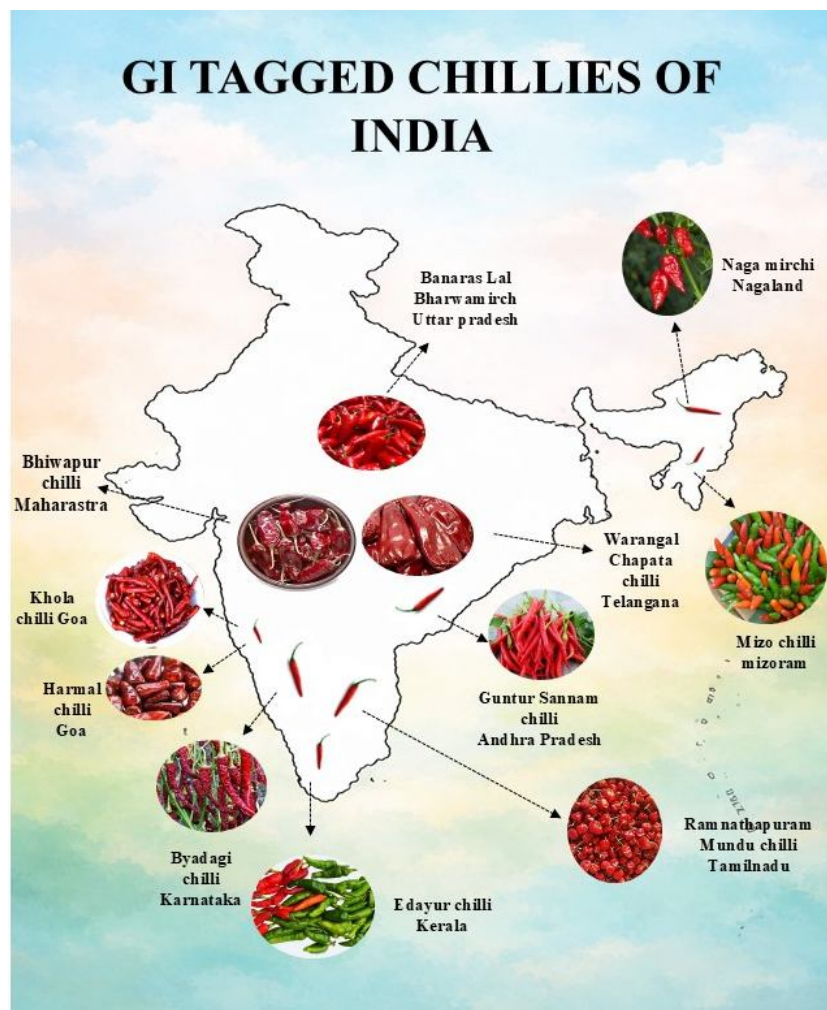
Fig. 2 : GI-Tagged Chillies and Their Regional Origins in India

heat to vibrant colours highlights the rich genetic diversity of Indian chilli landraces, and it emphasises the need to preserve these region specific cultivars through Geographical Indication (GI) protection for the interests of both farmers and consumers.